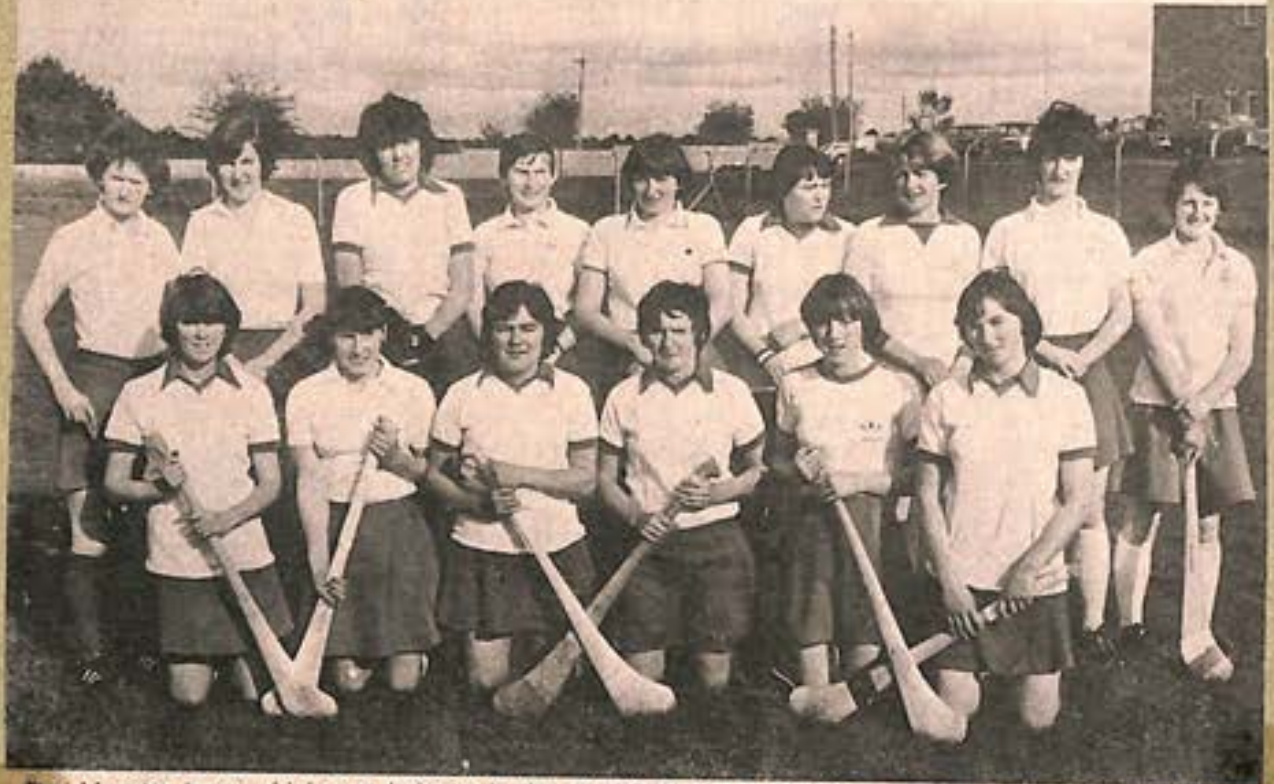
The Munster team which met Leinster in the semi-final of the Gael Linn camogie championship at Na Piarasigh Grounds on Sunday.