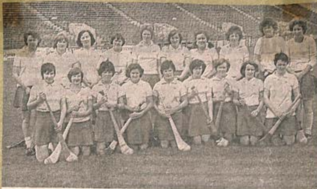
● WINNERS . . . The Cork team which beat Galway in the first round of the All-Ireland senior camogie championship at Pairc Ui Chaoimh yesterday.