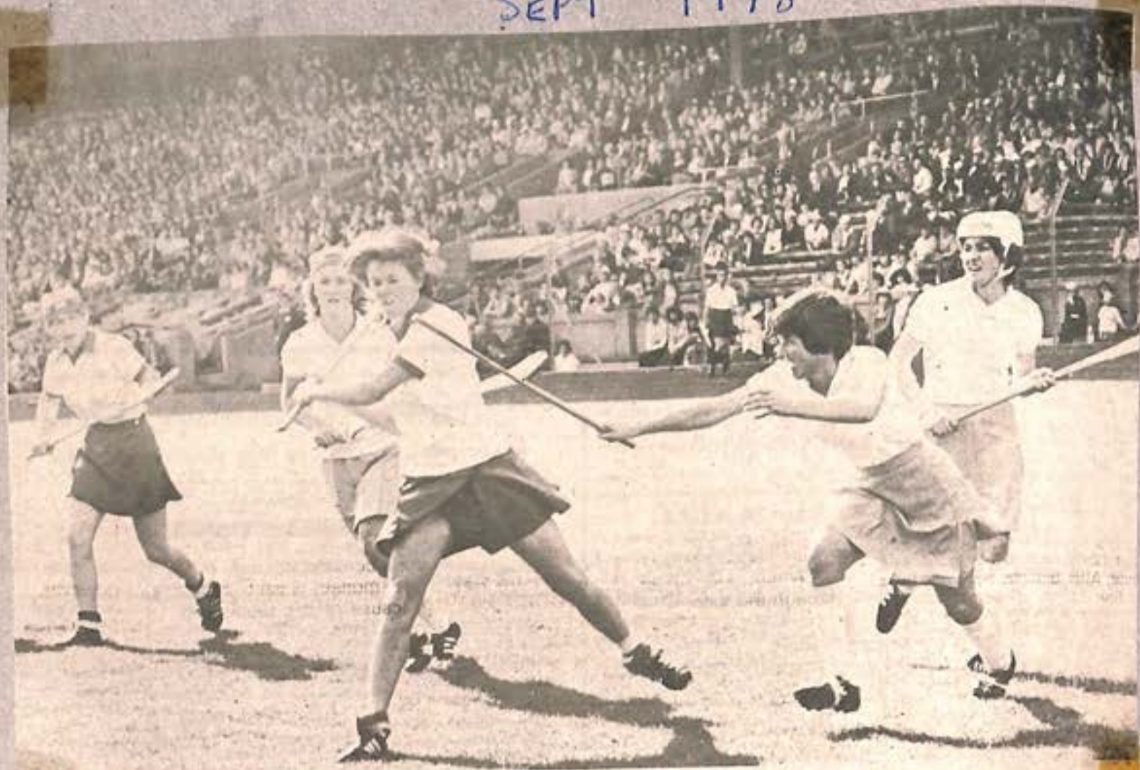
A scene of action in the Cork v. Dublin All-Ireland senior camogie final at Croke Park.