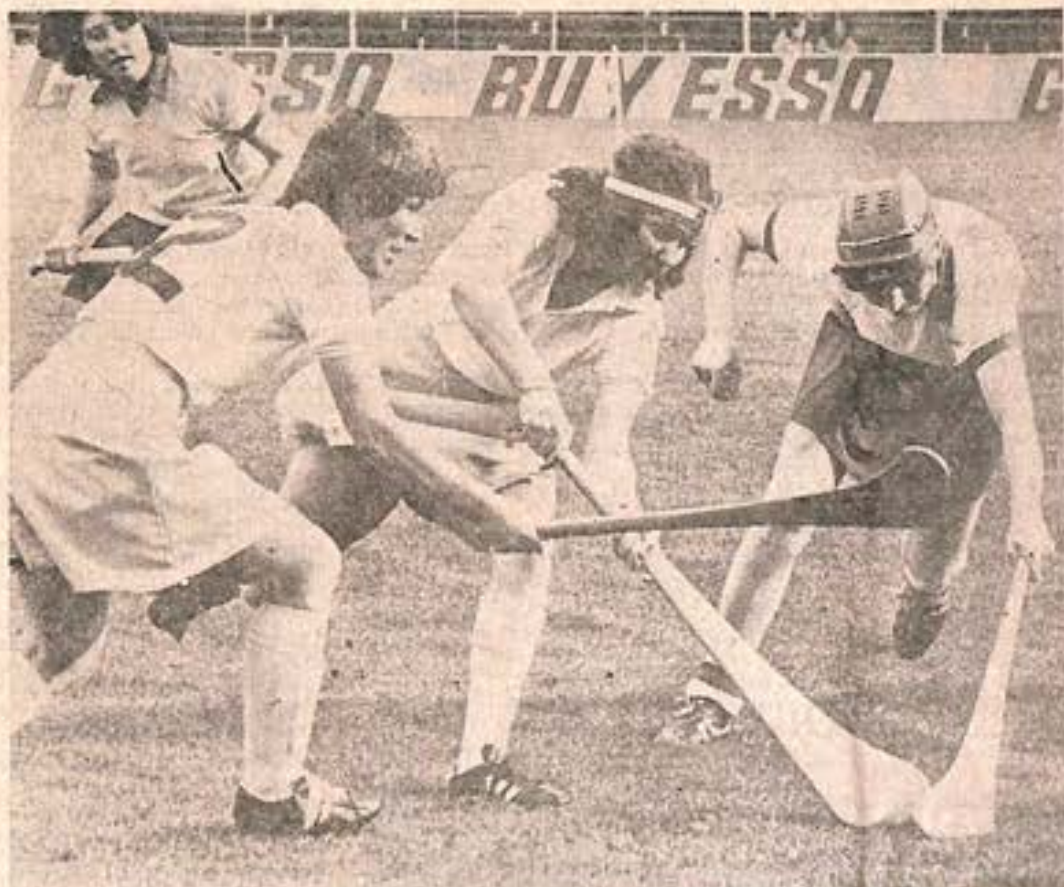
Dublin defenders get to the ball to halt a Cork attacker during the All-Ireland Senior Camogie final at Croke Park yesterday.