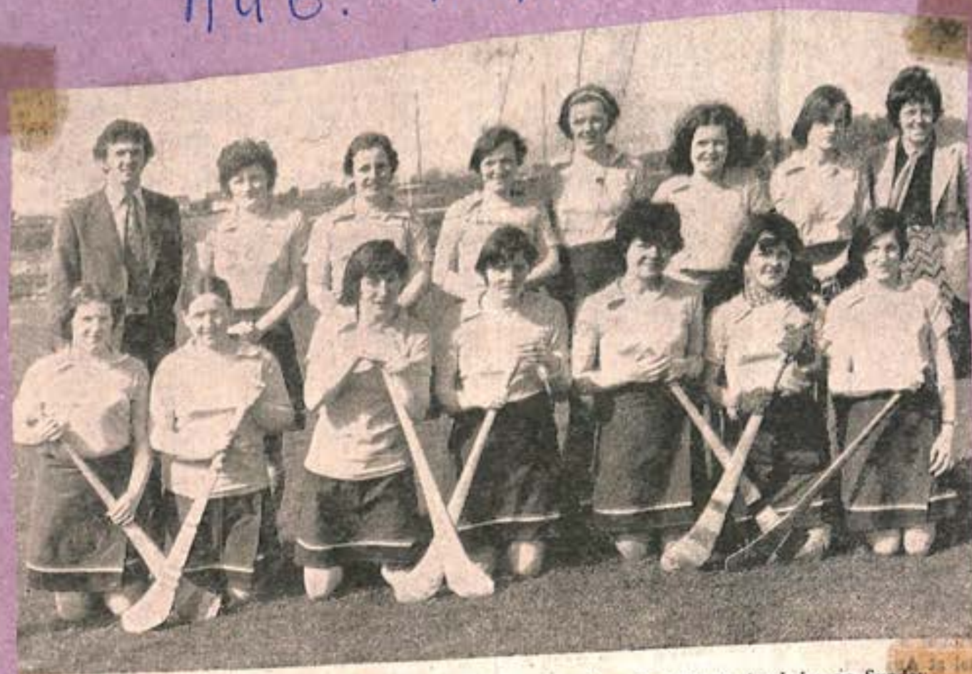
The Wicklow Junior Camogie team who won the Leinster championship at Aughrim on Sunday.