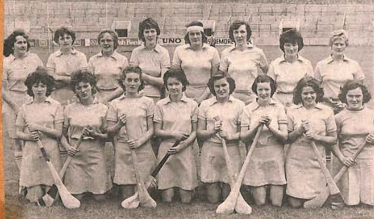
The Cork team (top) which played Clare in the All-Ireland senior camogie semi-final at Pairc Ui Chaoimh.