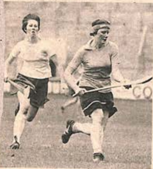
A Wicklow defender, in possession, chased by a Cork forward during the junior All-Ireland camogie semi-final at Pairc Uí Chaoimh yesterday