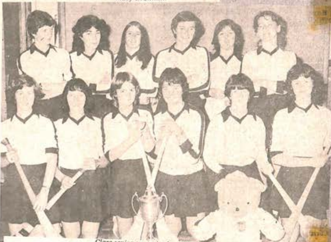
Clare senior camogie champions, Shannon