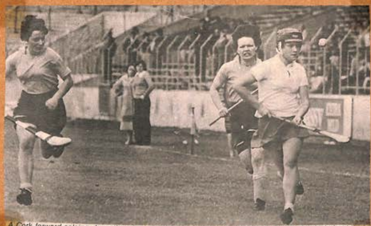
A Cork forward soloing down the wing, chased by two Wicklow defenders, during the All-Ireland Junior Camogie semi-final at Pairc Ui Chaoimh.