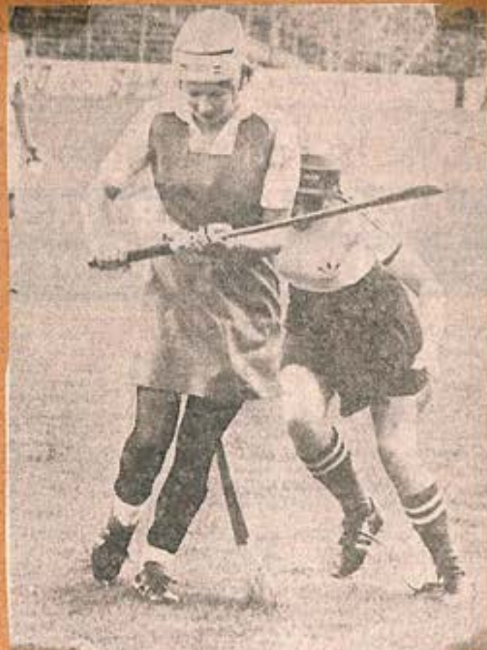
A Berry forward gets through with the ball in spite of Cork defender during the Junior Camogie final.