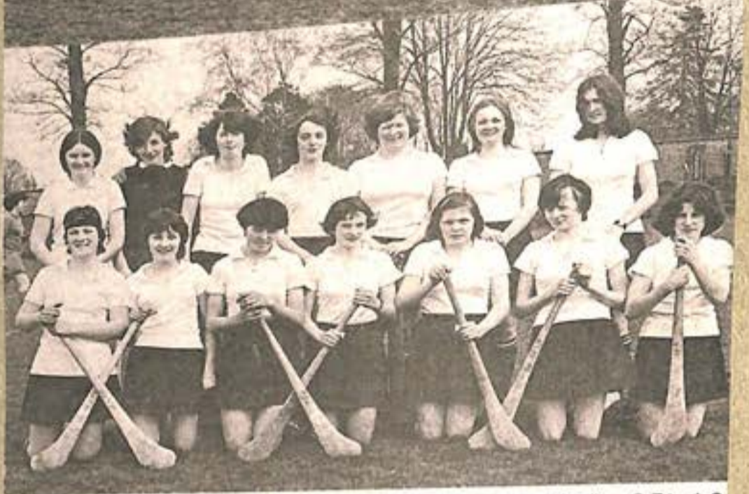
WON VOCATIONAL TITLE — The Cobh team which defeated Mallow 2-7 to 1-0 in the Cork County Vocational Schools Camogie Championship final at the Mardyke, Cork. Below: Vanquished Mallow team who lost to Cobh in the Cork County Vocational Schools' Camogie Championship final at the Mardyke, Cork.