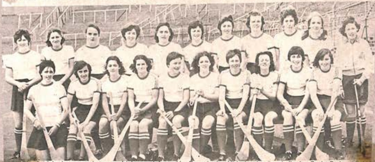
The Cork junior camogie team which was defeated by Derry in the All-Ireland camogie final at Croke Park recently.