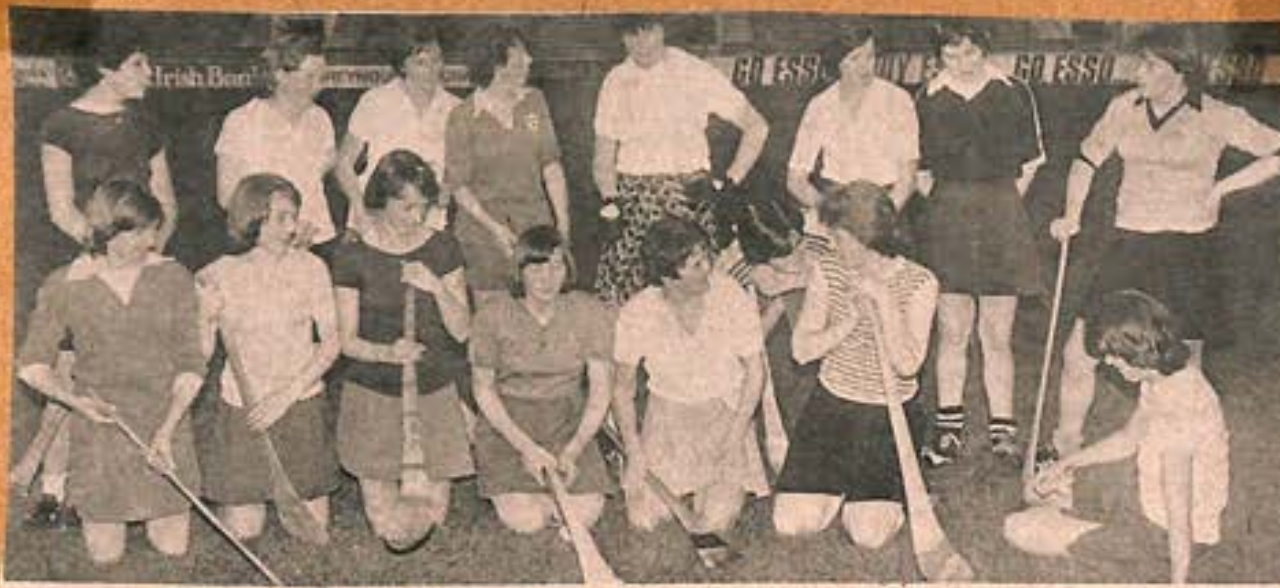
The Cork senior camogie team pictured during a training session at Paire Ui Chaoimh.