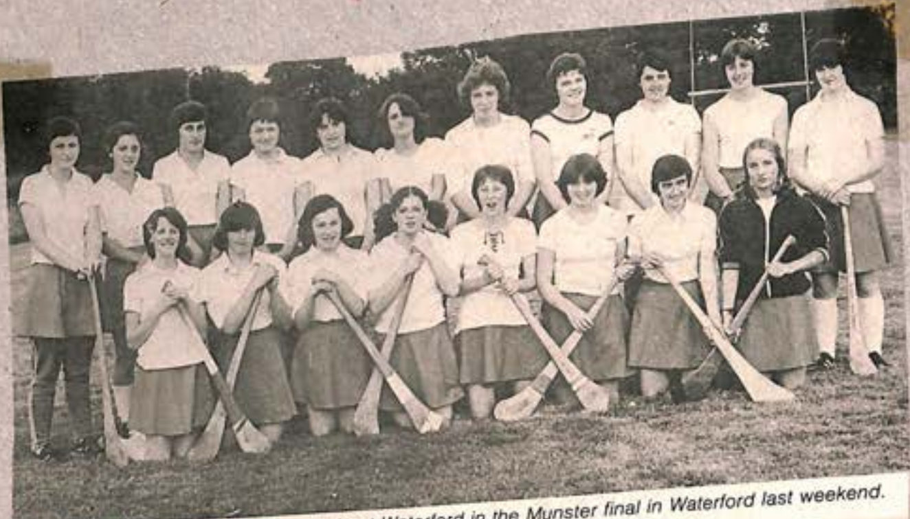
The Cork Junior camogie team who beat Waterford in the Munster final in Waterford last weekend.