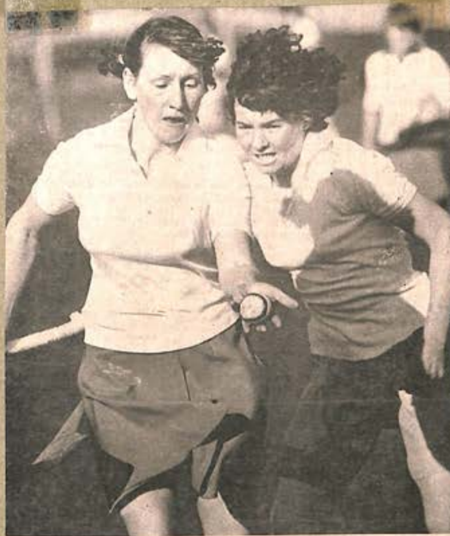
A Leinster defender fails to stop Munster from getting the ball during the semi-final of the Gael Linn camogie championship at Na Piarasigh grounds yesterday.