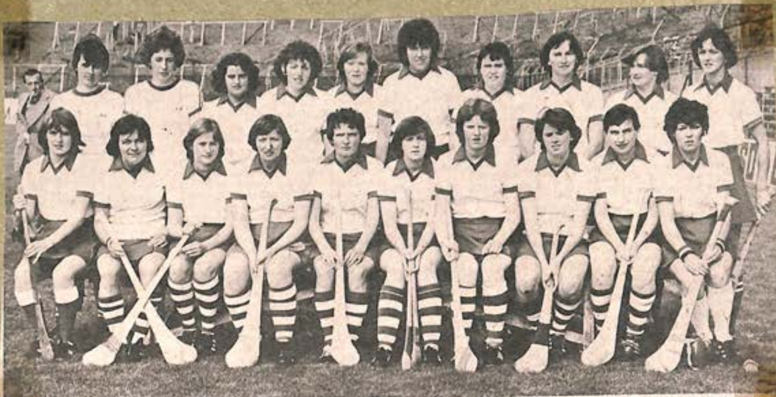
The Cork senior camogie team which defeated Dublin in the All-Ireland Senior Camogie Championship final at Croke Park.