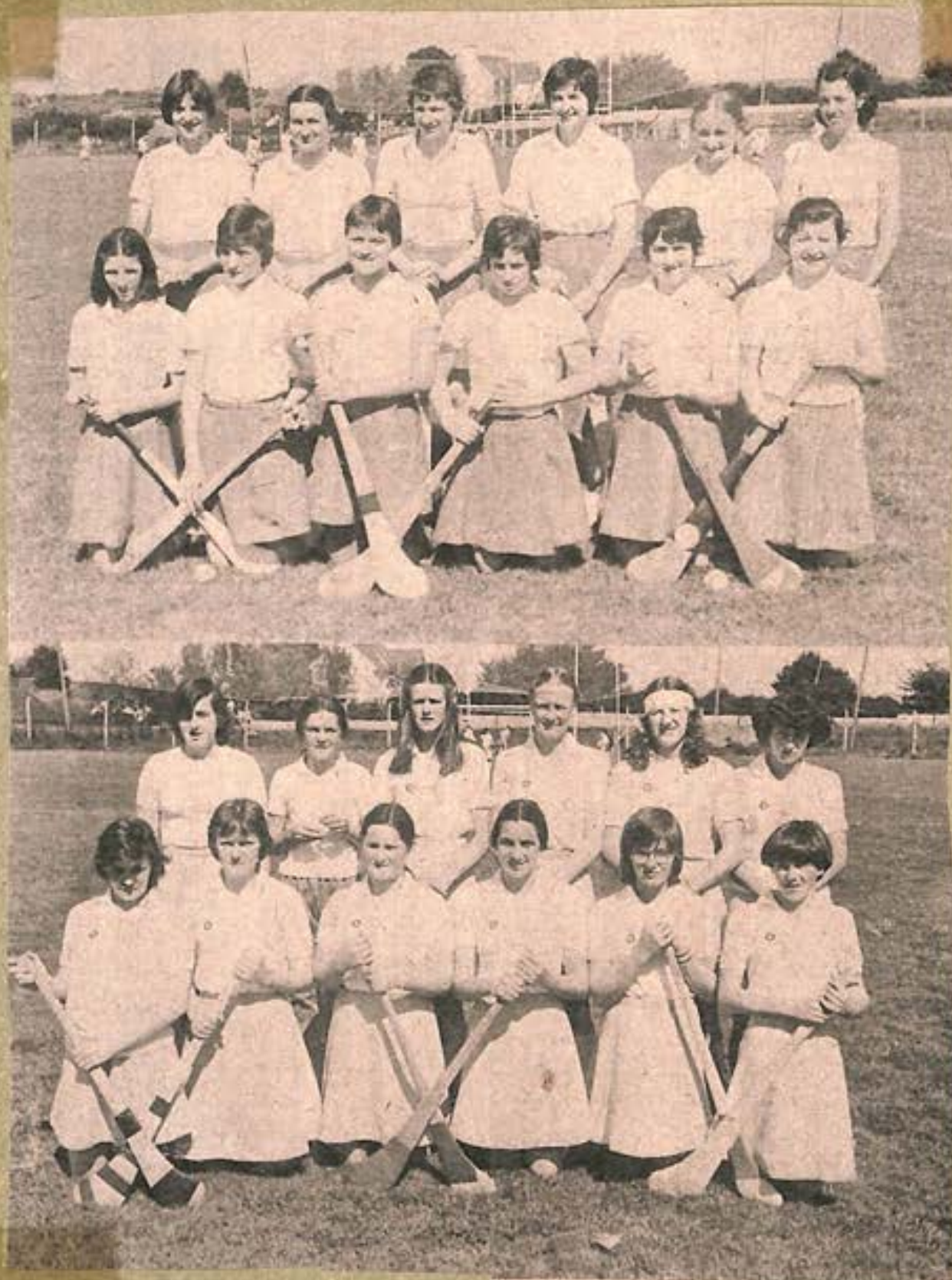
The Cork (top) and Dublin (bottom) teams which met in the minor All-Ireland camogie final at Na Piarasigh Grounds, Cork, yesterday.