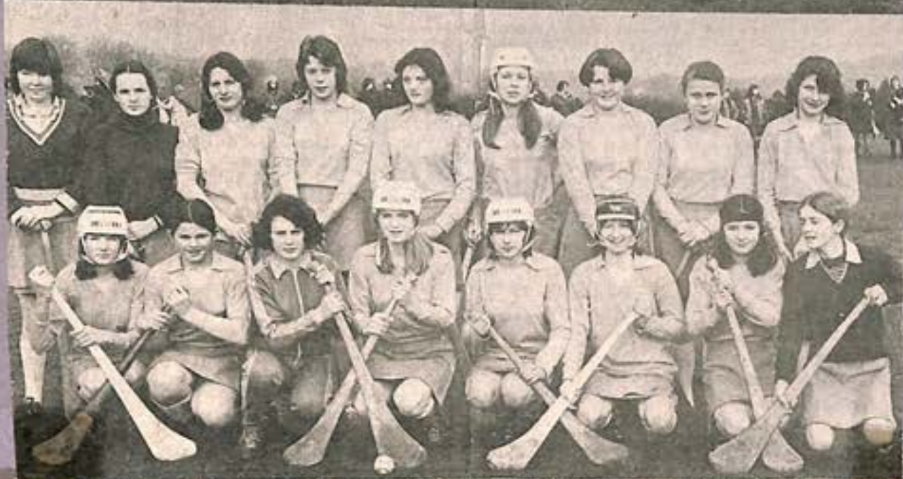
The Sacred Heart, Cork, team (top) that defeated Scioil Mhuire, Cashel, in the Munster Junior Colleges camogie final at Ballinure, Cork.