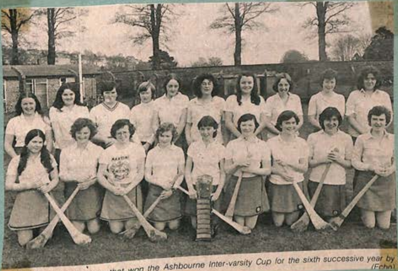
The U.C.C. camogie team that won the Ashbourne Inter-varsity Cup for the sixth successive year by defeating U.C.D. at Santry, Dublin, recently.