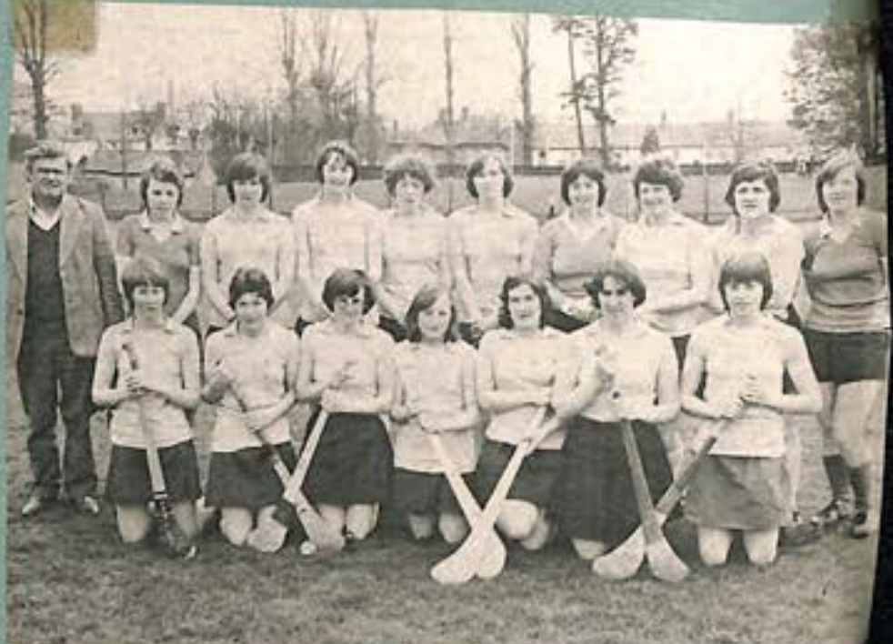
Imokilly, who lost to Eire Og in the opening game of the Cork senior camogie championship at the Mardyke, Cork.