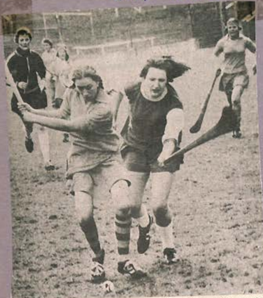
A tussle for possession during the All-Ireland Colleges senior camogie championship between Scoil Mhuire, Cashel and Presentation College, Athenry at Croke Park.