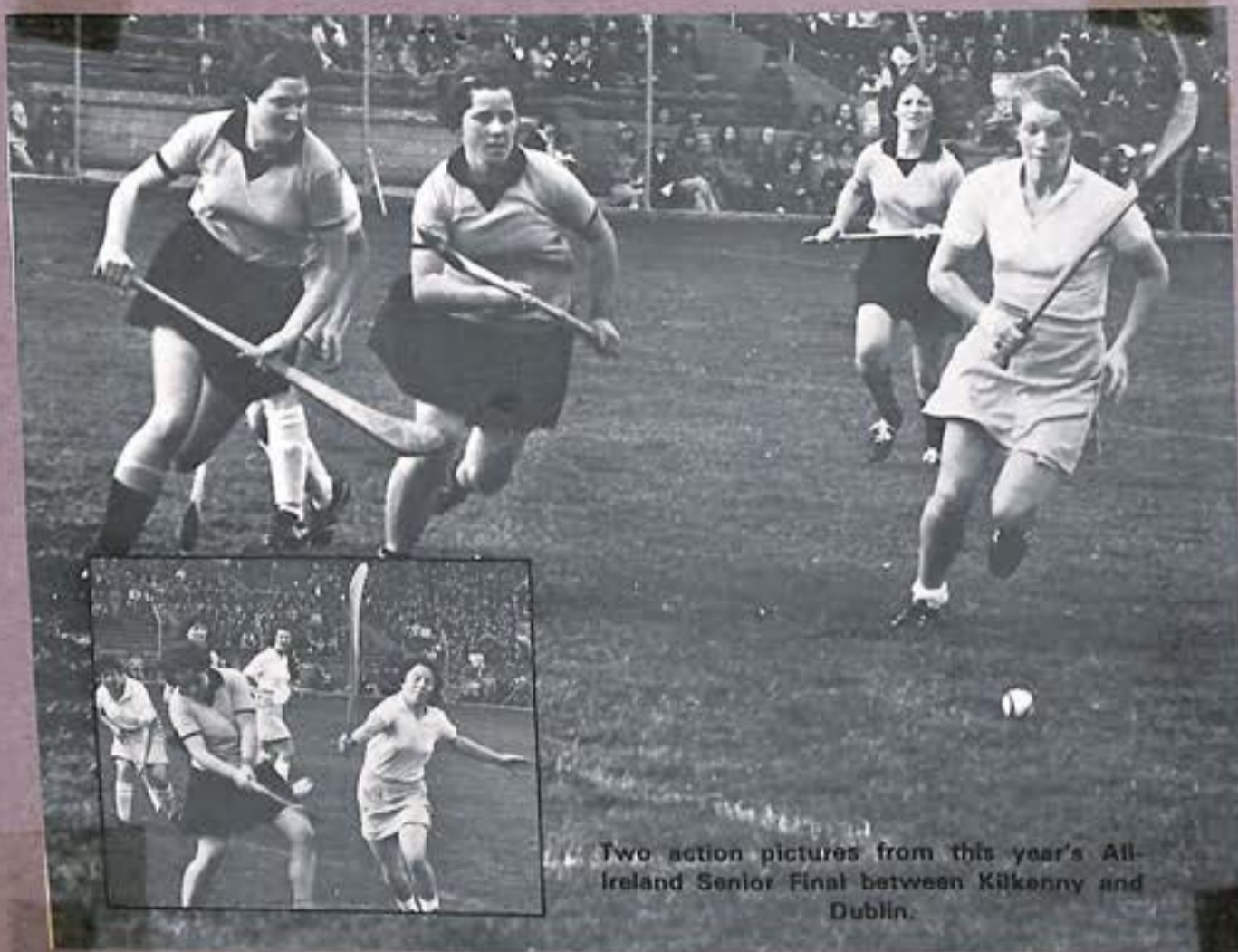
Two action pictures from this year's All-Ireland Senior Final between Kilkenny and Dublin.

It was also a satisfactory year as far as the distribution of honours went. Kilkenny recaptured the senior All-Ireland title, the junior crown returned to Down after an eight-year lapse, the All-Ireland club title was captured by the West Limerick Club, Croagh-