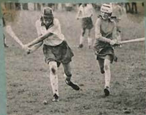
A girl from Sacred Heart, Cork, about to clear the ball in the pouring rain as her opponent from Presentation, Cashel, races in during the Munster junior colleges camogie final at Ballinure.