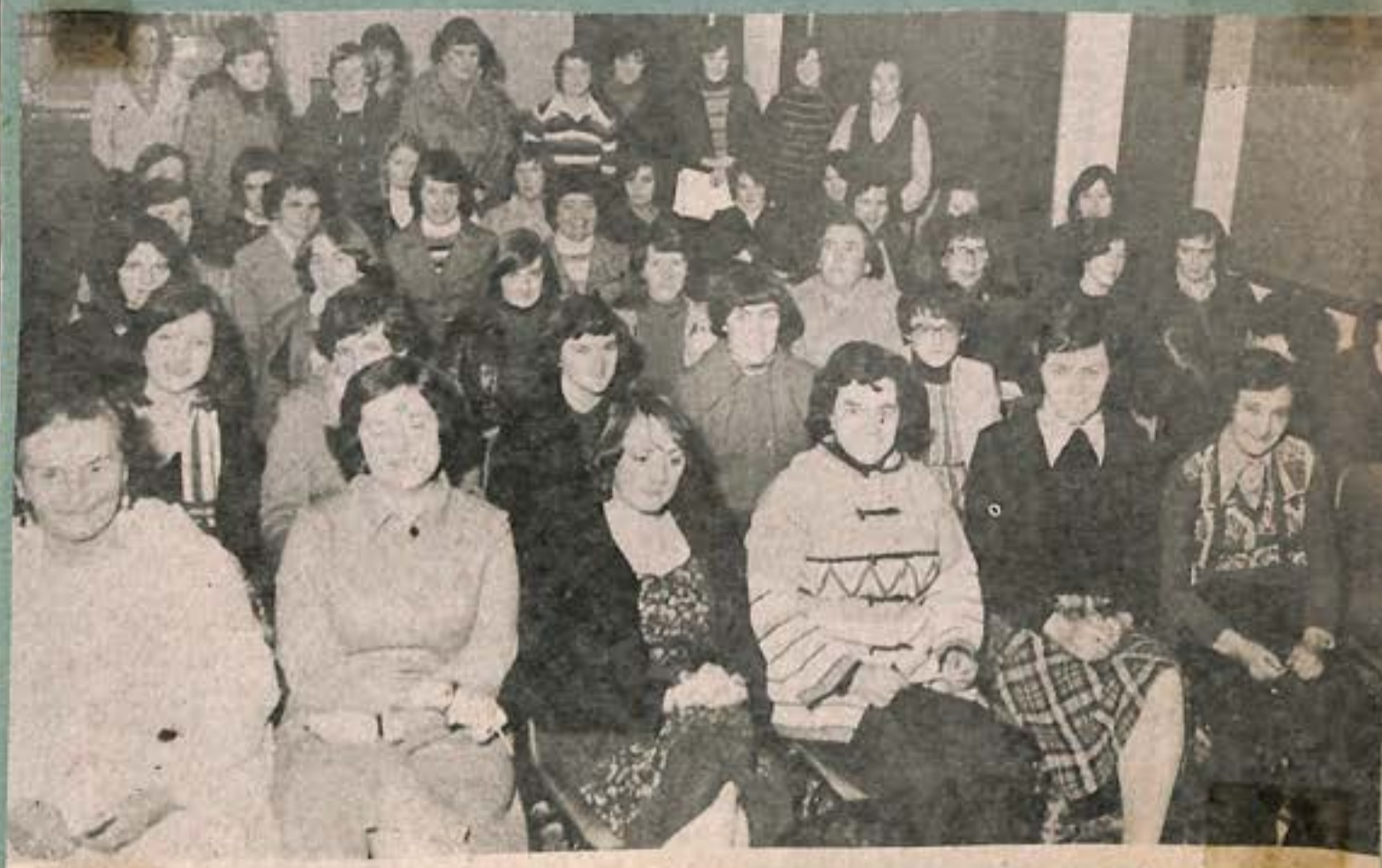
Officers and delegates at the Cork County Camogie Board annual convention at the Imperial Hotel, Cork.

They are the devoted people who keep the wheels turning at schools and colleges and club level. The people who run, and who attend, County Board meetings, who selflessly serve the Association and the game they love in any and every capacity. If I had the handing out of Awards and Oscars I would give one each to everyone of those devoted and dedicated people, whose names never make a headline, but without whom no amateur organisation such as ours could exist for a single week.