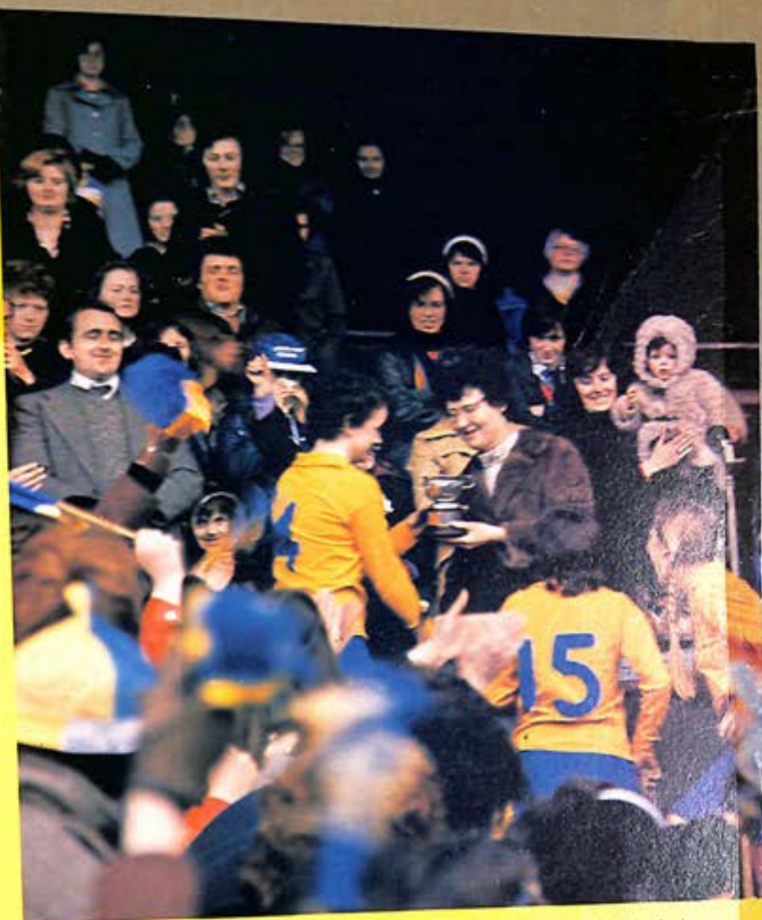
The winners of the camogie titles - TOP: Presentation, Cashel (Senior); and, BOTTOM: Presentation, Athenry (Junior).