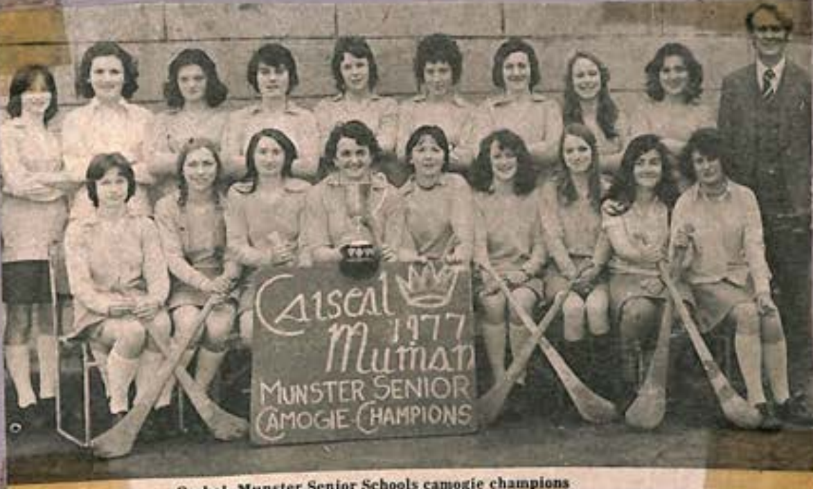
Cashel, Munster Senior Schools camogie champions