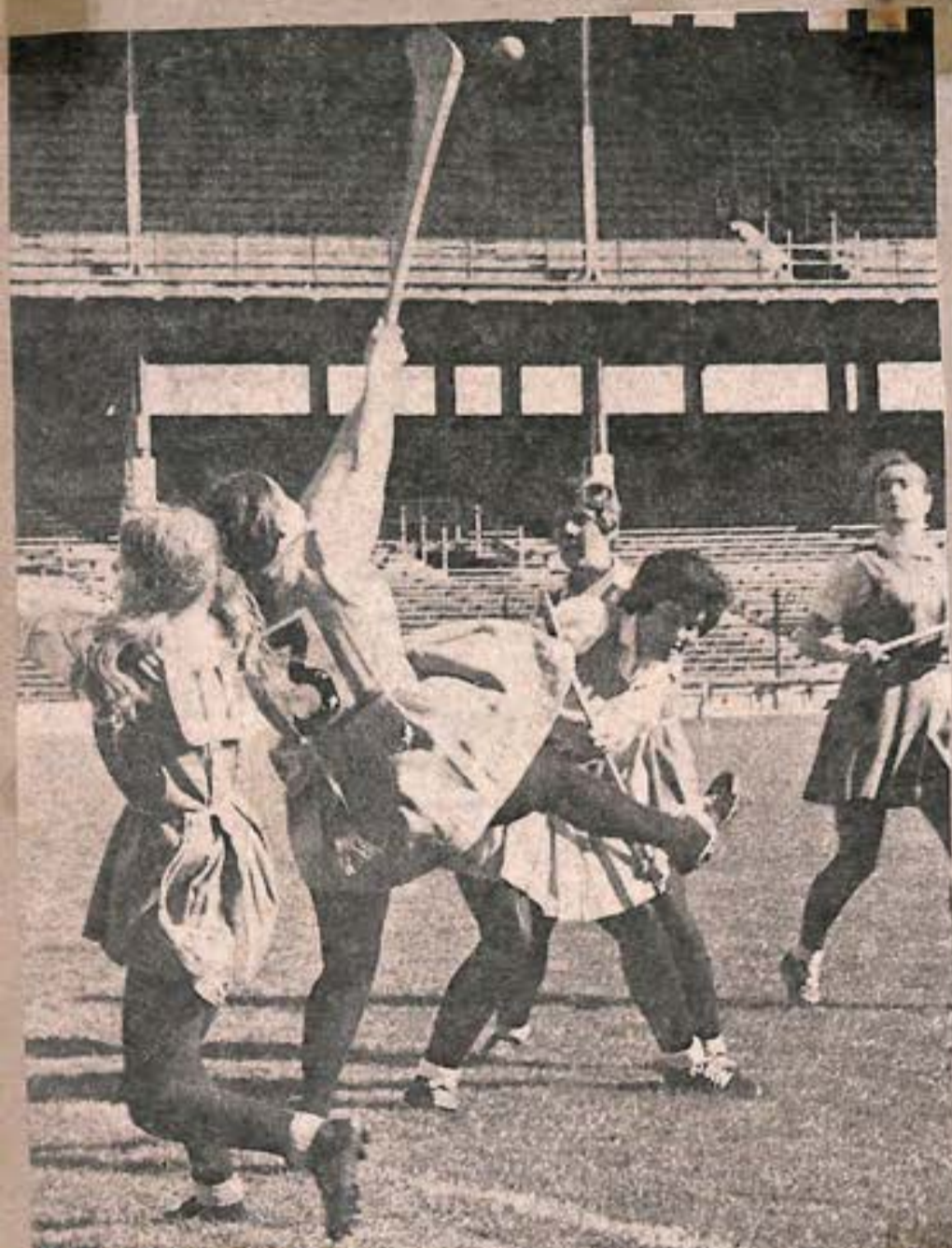
for a high ball in the All-Ireland senior camogie semi-final between Antrim and Wexford at Croke Park yesterday.