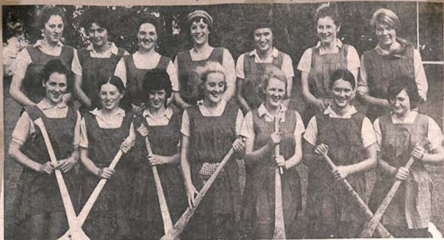
The Roscommon Co. Camogie Team which defeated Mayo in the Connacht Camogie Final at Breaffy Park, Castlebar, on Sunday.