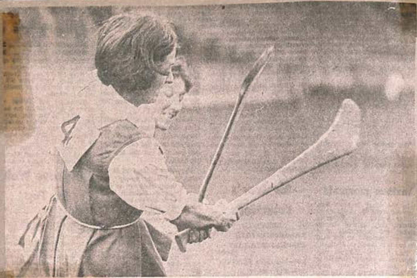
● A fine shot from the All-Ireland senior camogie final between Cork and Wexford at Croke Park yesterday.