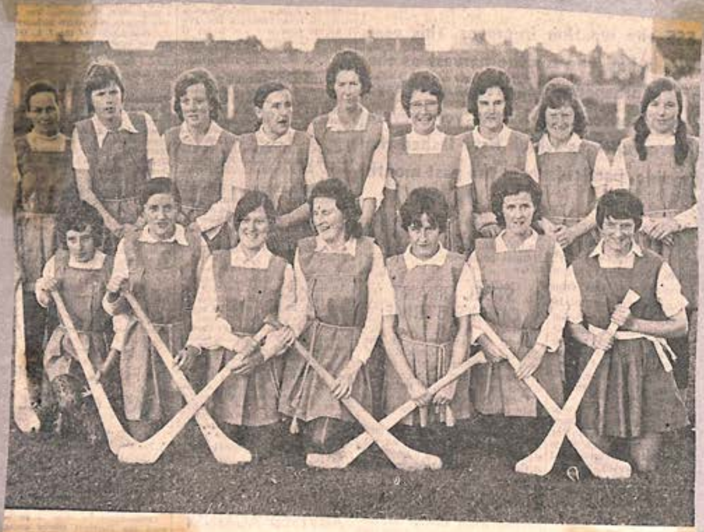
CAMOGIE CHAMPIONS —The Ahane team which defeated Emmets by 2-3 to 0-1 in the final of the Co. Limerick Senior Camogie Championship at the Gaelic Grounds. This is Ahane's fifth successive win in the championship.