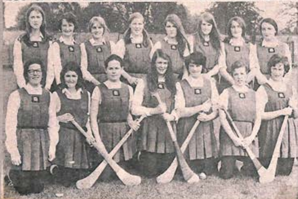
MET IN SEMI-FINAL —The Aloysians team which defeated U.C.C. in the semi-final of the Cork Co. Senior Camogie Championship at U.C.C. Grounds, Cork.