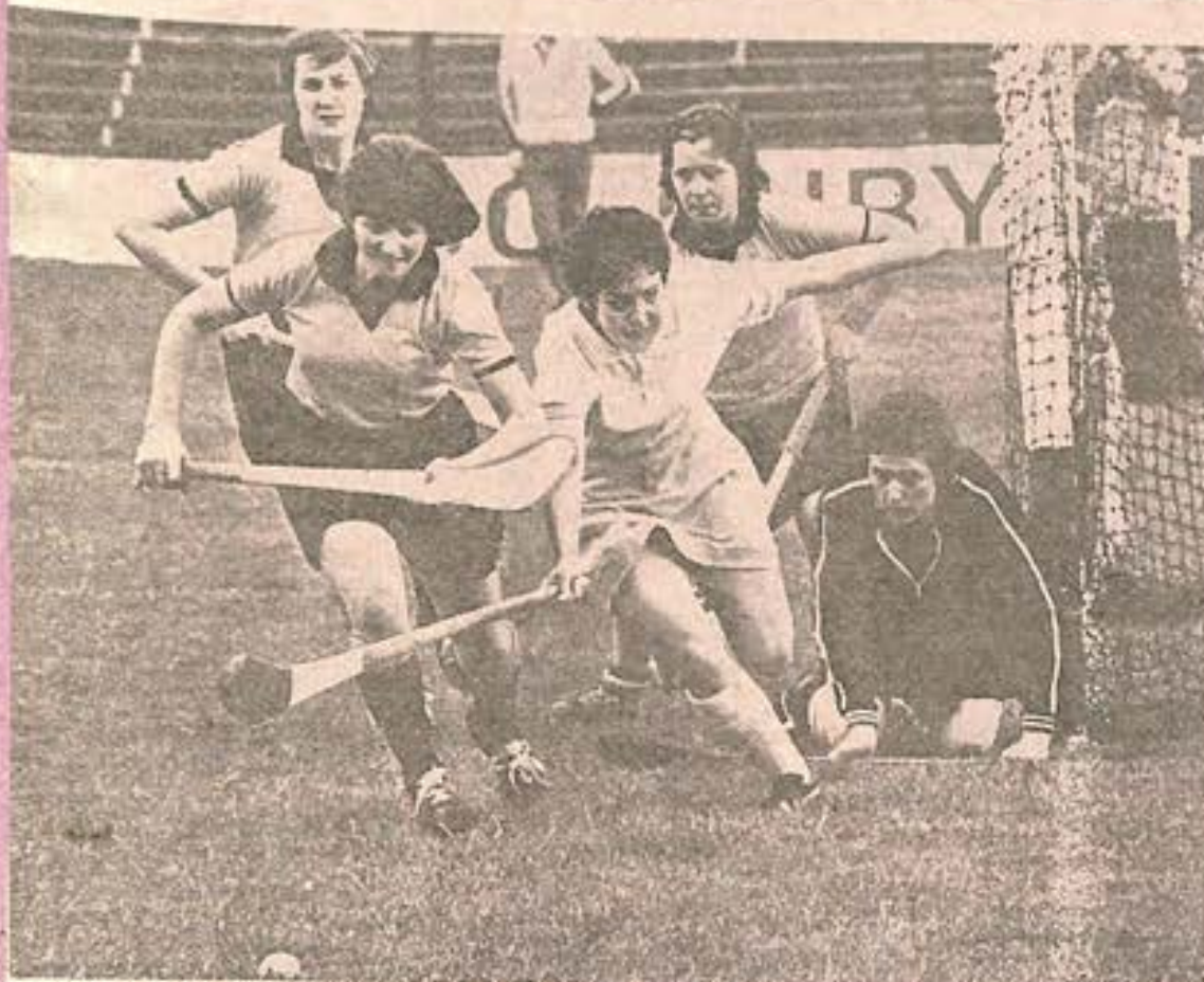
Action in the Kilkenny goalmouth as Dublin narrowly fail to score in All-Ireland Camogie final at Croke Park yesterday.