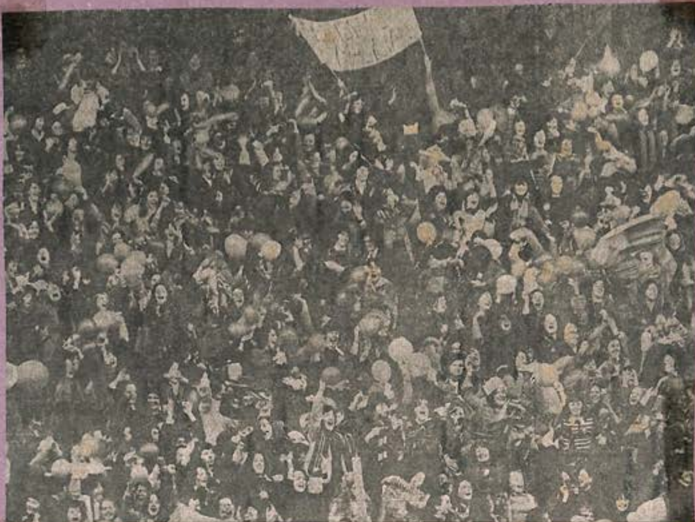
JUBILATION—Happy St. Als supporters cheering their side on to victory over Presentation, Athenry, during the All-Ireland Senior Colleges camogie final at Croke Park on Saturday.