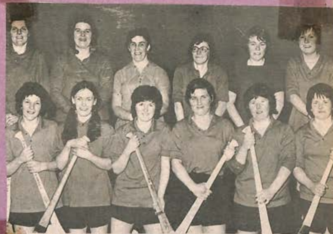
The Churchtown North (Midleton) Camogie team which beat Sarsfields (Glanmire) 5-9 to 3-1 at Midleton.

St. Patrick's, Drumcondra, became the first non-university side ever to win the Higher Institutes League, when they narrowly defeated U.C.G. in a most exciting final at Galway last weekend.