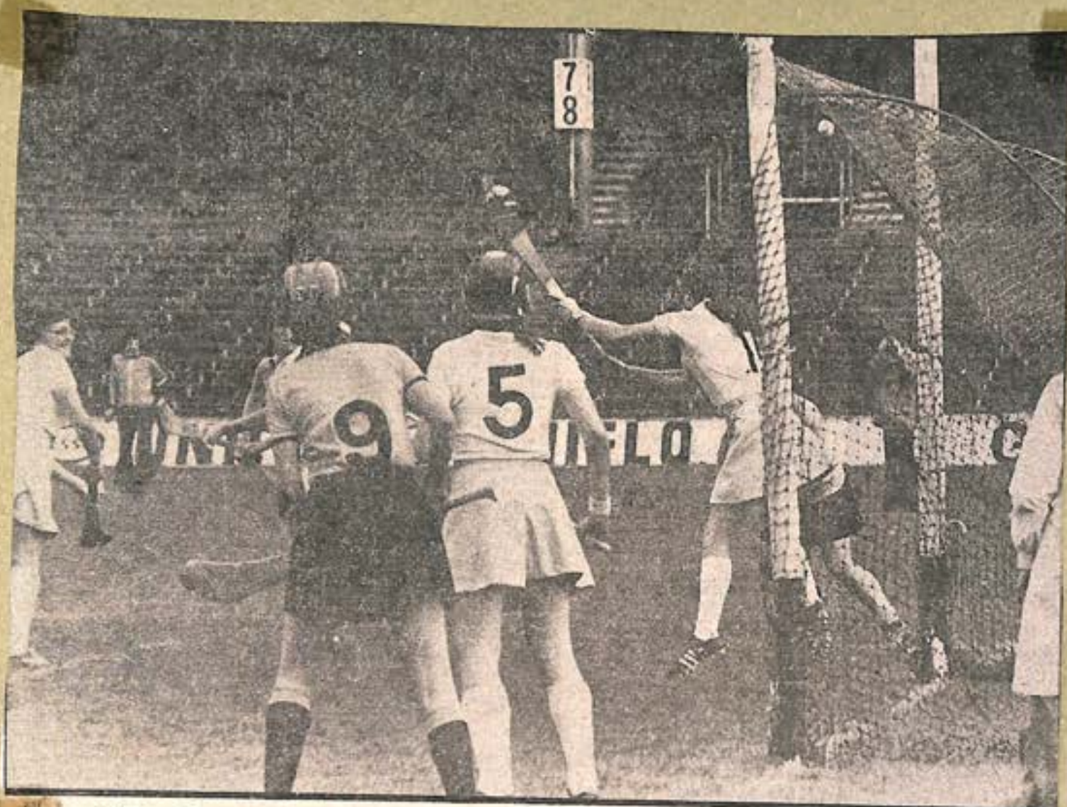
Above and below: Some of the action during last Sunday's All-Ireland camogie final, in which Kilkenny beat Dublin by six points to one goal and two points.