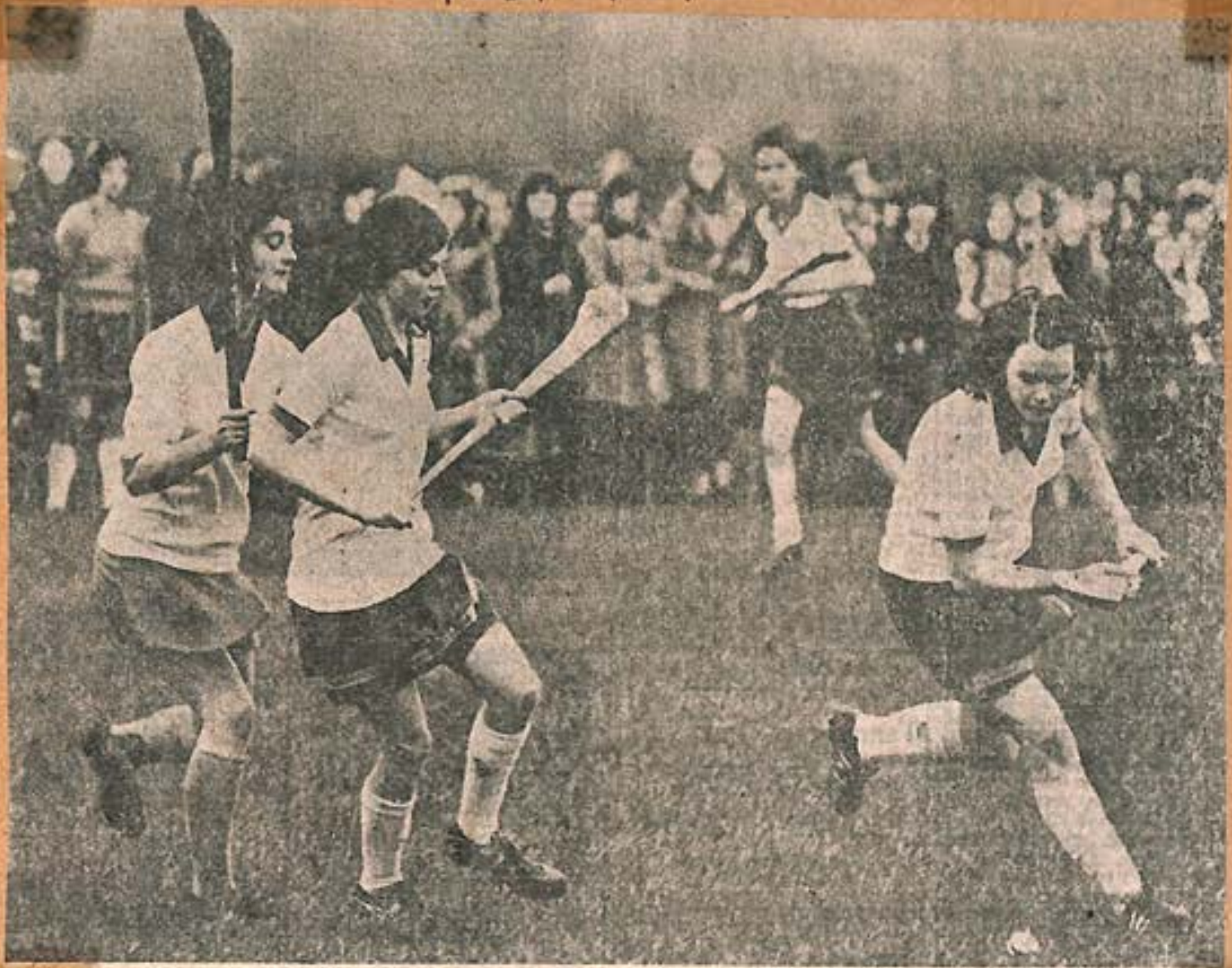
A St. Als forward about to rise and strike for a point during the Munster Colleges Camogie Final against Mt. Mercy at Curraheen Road on Saturday.