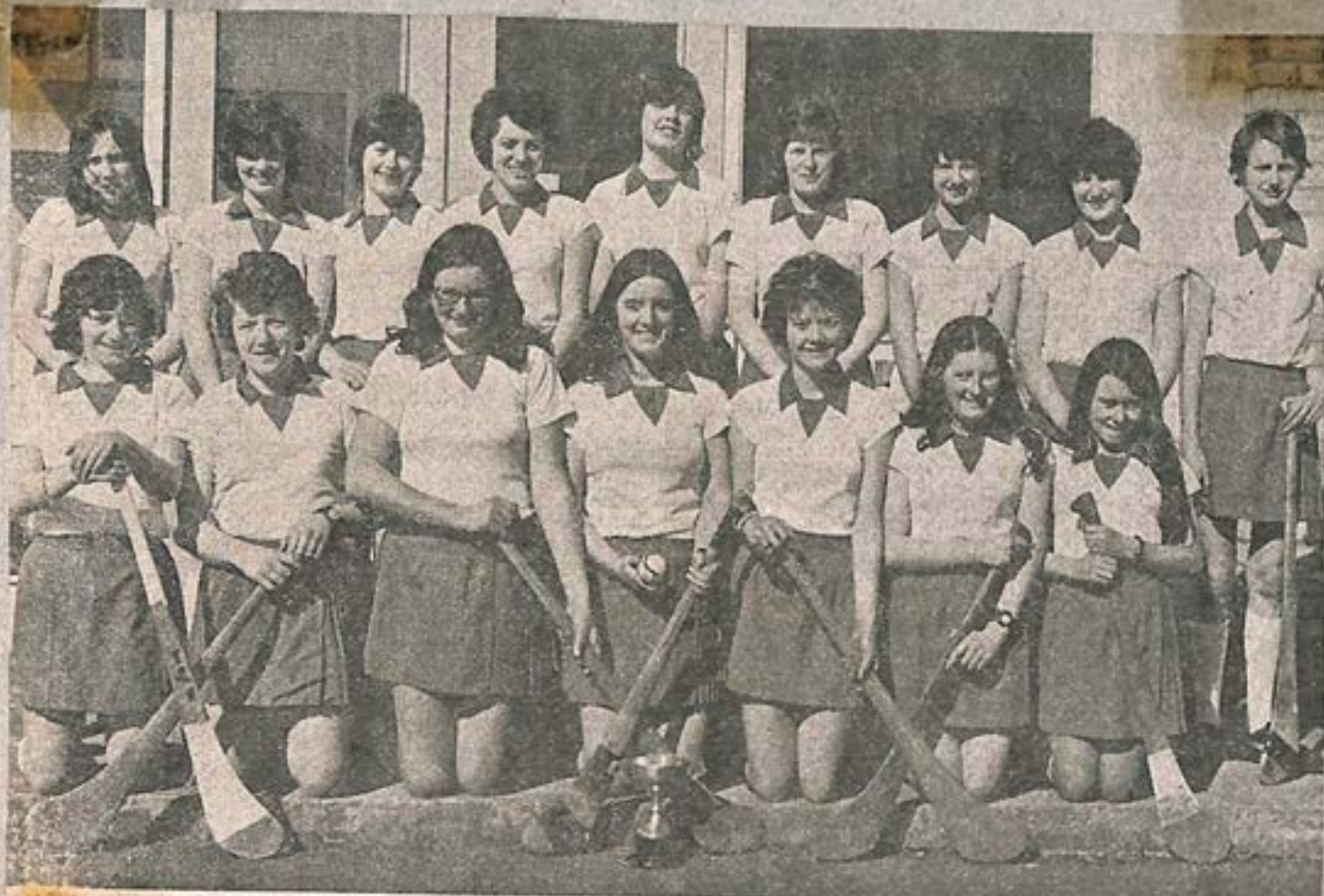
The Sacred Heart Secondary School, South Douglas Road Camogie team which beat Clonakilty to win the Keane Cup in the Cork County Junior Schools League.