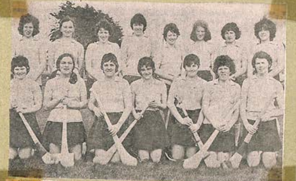
WON OPENING ROUND —To top: Imokilly, who scored a great win over St. Gobbans in the opening round of the Cork County Senior Camogie Championship game at U.C.C.