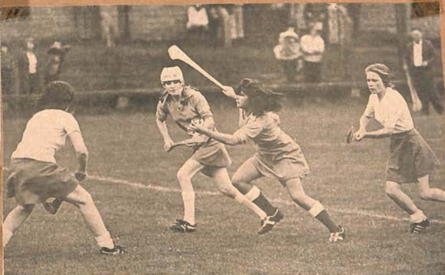
A Tipperary forward clutches the ball as she is about to break through the Cork defence during the Munster Minor camogie final at the Mardyke.