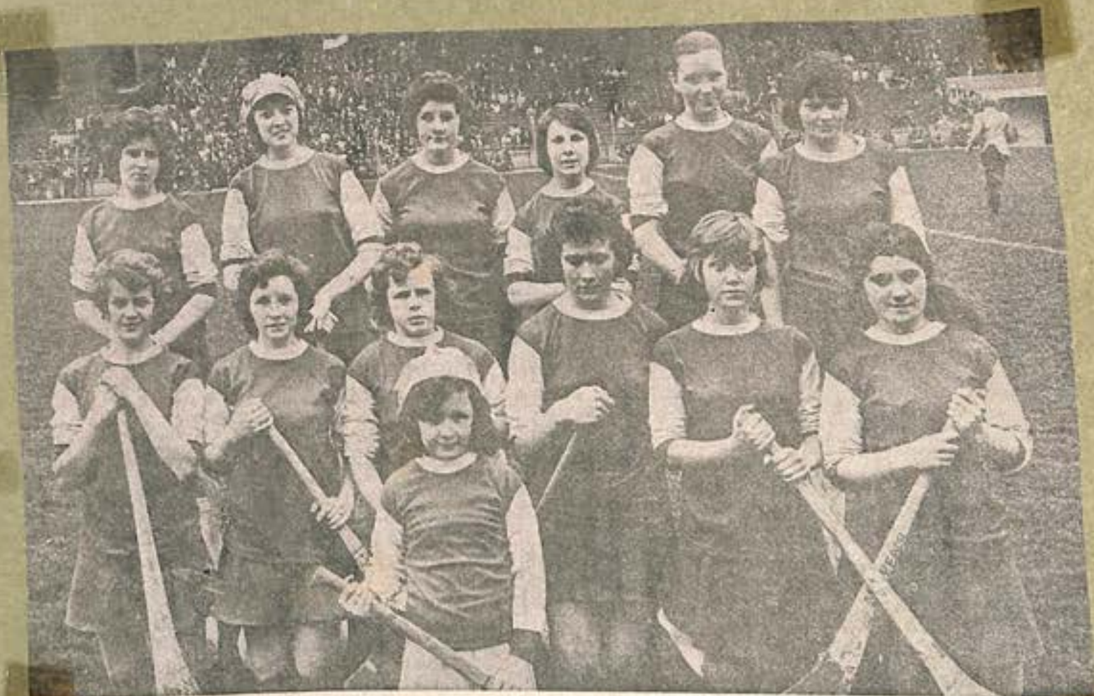
ST. ALS ARE CHAMPIONS— The St. Aloysius team (top), which defeated Presentation, Aghery (bottom), to become the first Munster team to win the All-Ireland Senior Colleges title, at Croke Park on Saturday.