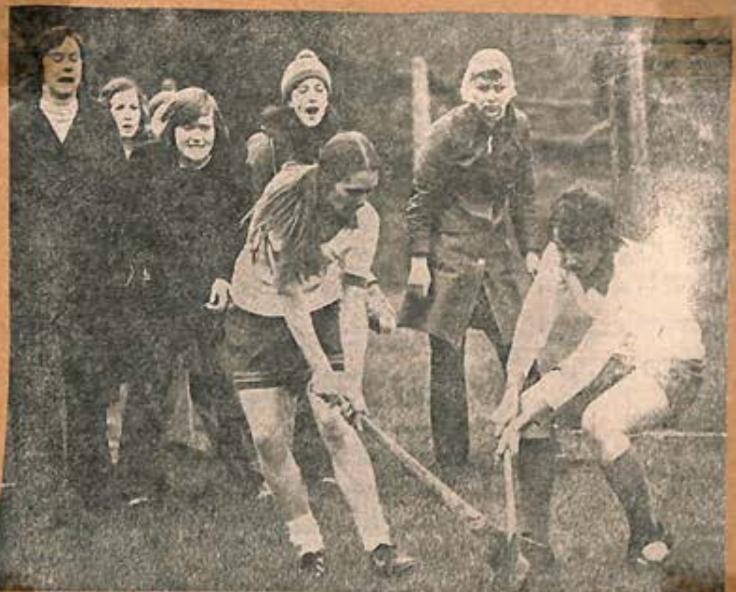
SHOOT! — A St. Als forward (left) has plenty of vocal support from the line as she shoots for the Mt. Mercy goal during the Munster Colleges camogie final at Curraheen Rd on Saturday.