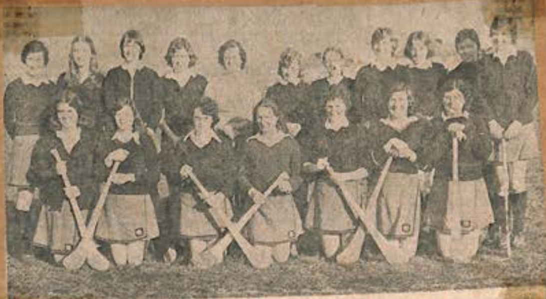
The University College, Cork, camogie team, winners of the Ashbourne Cup inter-varsity competition for the fifth year in succession.