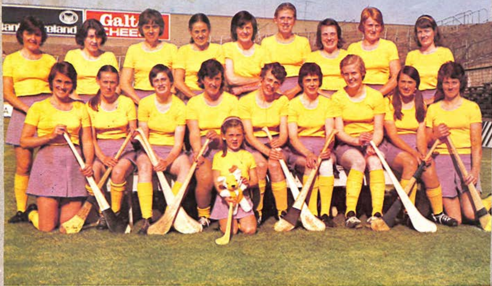
LOCH GARMAN: All-Ireland Senior Camogie Champions 1975.