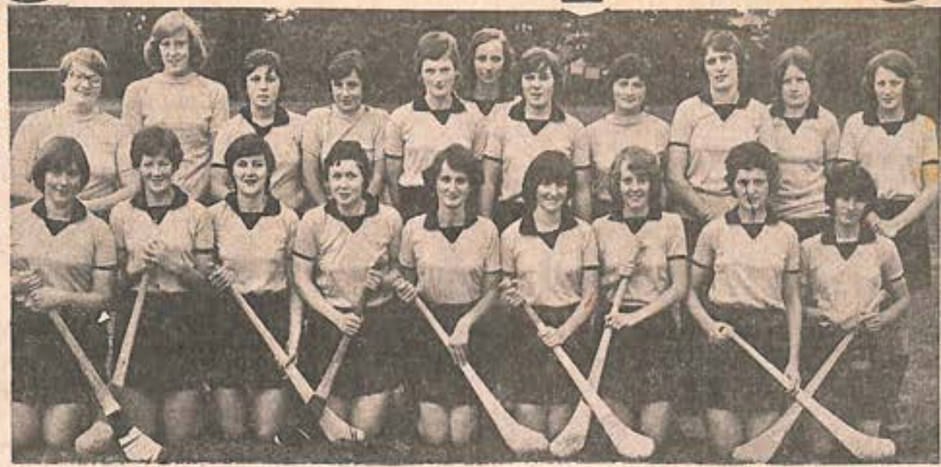
KILKENNY . . . All-Ireland Senior Camogie Champions, 1976

But the winners flattered only to deceive and in the opening 10 minutes two