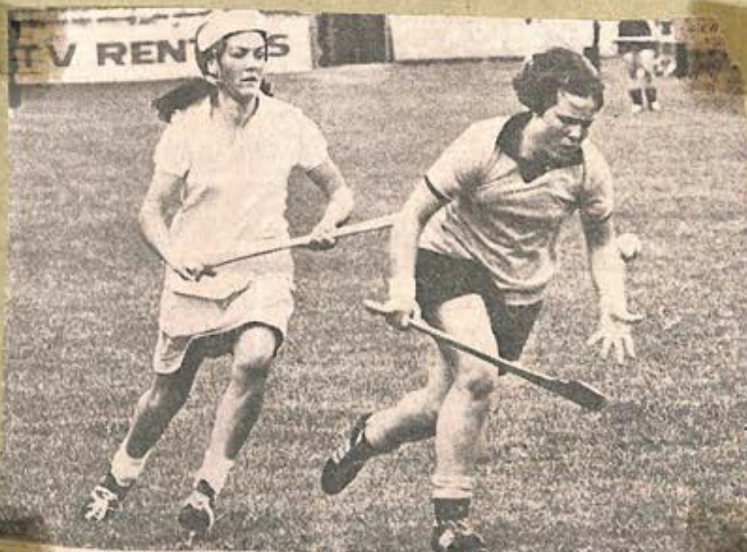
CAMOGIE ACTION—A Kilkenny forward brings the attack into the Dublin goal area during the All-Ireland camogie final in Croke Park. Kilkenny regained the championship with a 0-6 to 1-2 win.