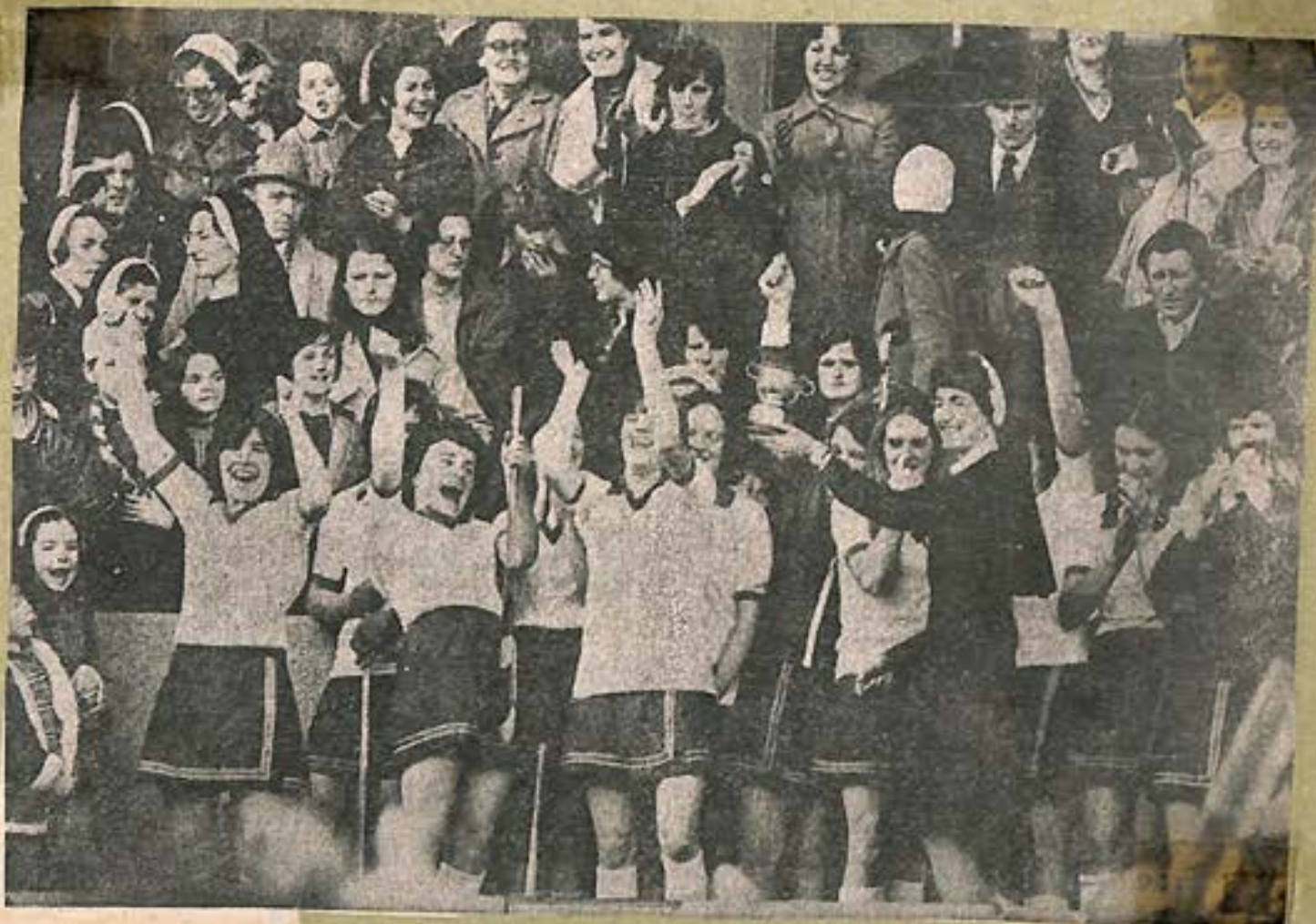
St. Aloysius (Cork) players in jubilant mood after they had become the first Munster school to win the senior All-Ireland Colleges' camogie title when they beat Presentation (Athenry) in the final at Croke Park on Saturday. See report on page 9.