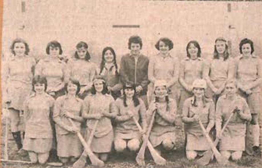
Loreto Convent, Youghal (top) who were beaten by Scoil Mhuire, Cashel (below) in the Munster Senior Camogie semi-final at Copperalley, Youghal.