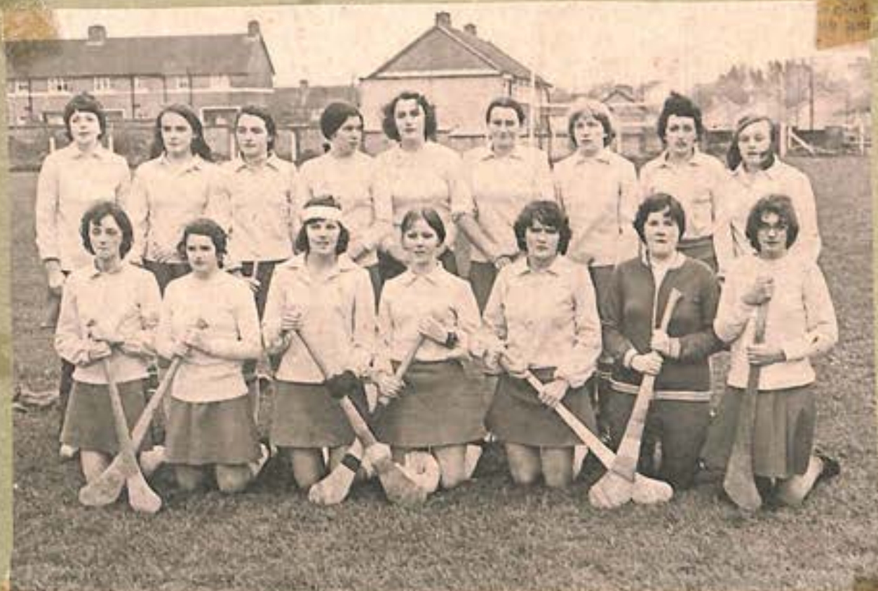
MUST MEET AGAIN — The Eire Og team which drew with Killeagh in the Cork Co. Intermediate Camogie Championship final at Ballinlough.

Munster Junior Colleges Quarter Finals played on Saturday: Scoil Mhuire, Cashel 4-2; Loreto, Youghal 1-1; Presentation, Bandon 3-1; Mount Mercy 1-0. Sacred Heart 5-1; North Presentation 1-1.