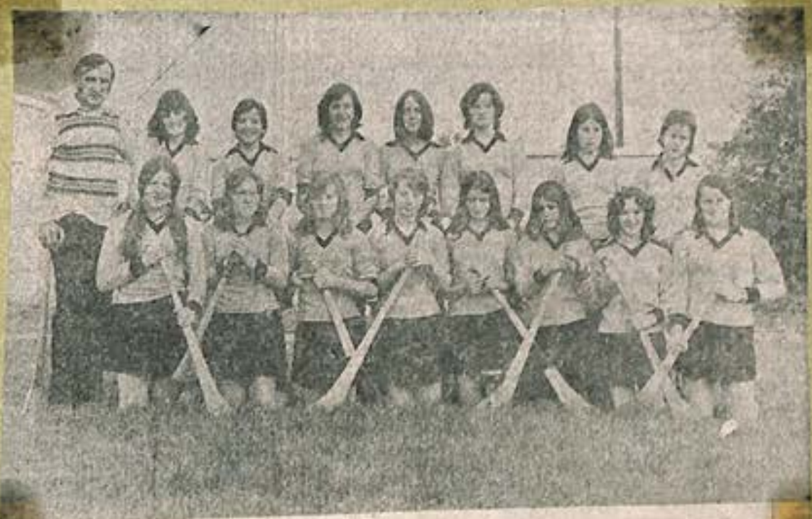
Ballypheheane camogie team, winners of the Cork City & County Under-16 League, 1974/75.

Later, a missed '30' was all that stopped them both winning the Colleges final and completing a fantastic treble — Colleges, Club and Inter-county All-Irelands. Presentation, Athery beat Callan in extra-time.