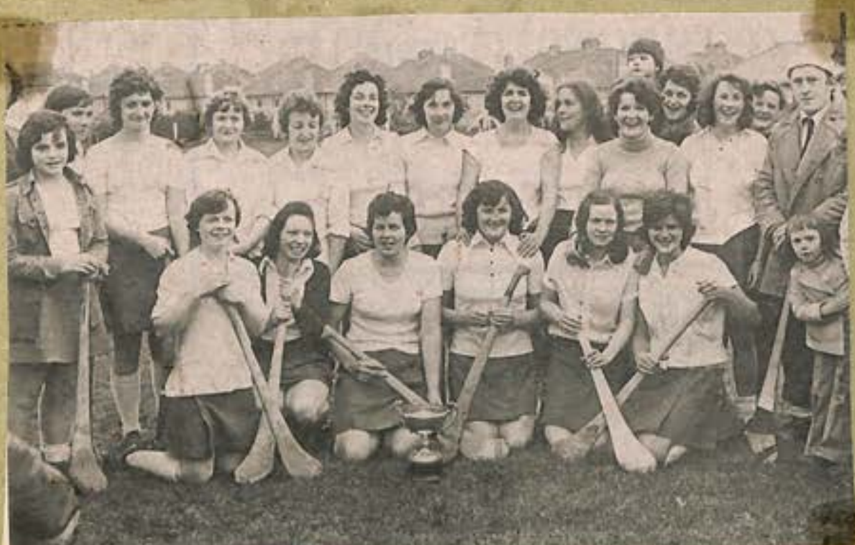
COUNTY JUNIOR CHAMPION — Inniscarra, who defeated St. Finbarr's 1-6 to 1-2 in the Cork County junior camogie championship final at Ballinlough, Cork.